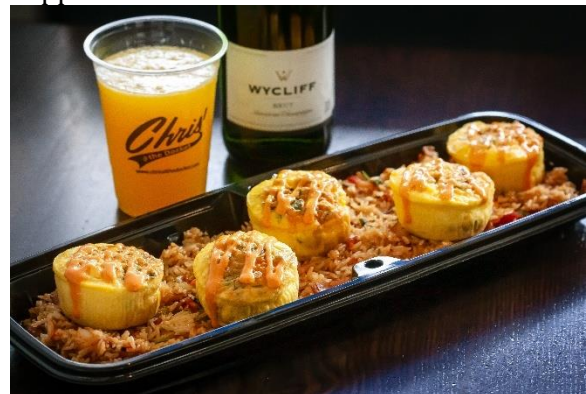
HK Egg Souffle $50 5 Egg Souffle with Chicken, Jalapenos, Ginger, Soy Sauce, Cilantro, Onions Topped with House Spicy Aioli on Fried Rice