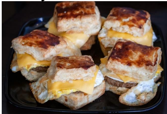
Signature Biscuit Sandwiches $40 5 Turkey Sausage, Fried Egg, American Cheese on Our House Made Biscuit