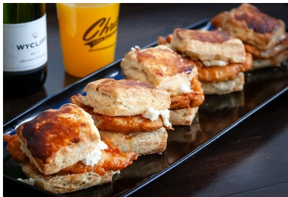
Chicken & Biscuit Sandwiches $50 5 Crispy Chicken Breast, Fresh Goat Cheese, Sweet Spicy Syrup on Our House Made Biscuit