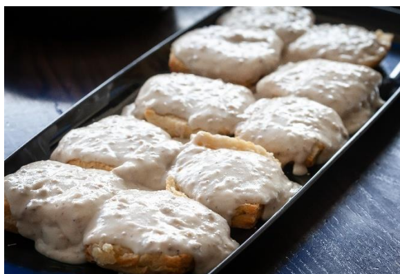
5 Biscuit & Gravy $30