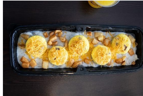
Country Breakfast Souffle $40 5 Individual Country Souffle Filled with Sausage & Onions, Topped with White Sausage Gravy, Cheddar Cheese and Breakfast Potato Cubes