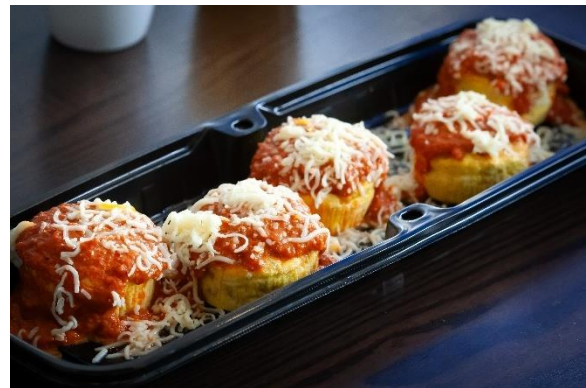
Tower Grove Breakfast Souffle $40 5 Individual Tower Grove Souffle Filled with Turkey Chorizo, Tomato, Onions, Jalapeno Topped With Ranchero and Provel