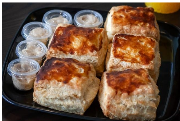
5 Biscuits & Butter $20