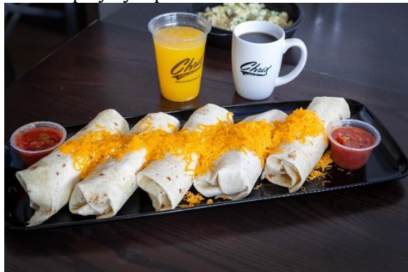
Chris' Breakfast UFO Burritos $50 5 Eggs Scrambled With, Jalapenos, Smoked Chicken, Tomato & Onions. Wrapped With Cheddar Cheese in A Flour Tortilla And Served With Salsa On The Side.